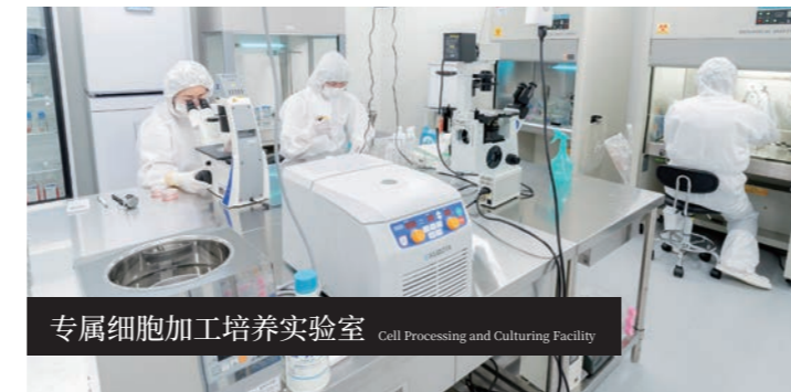
专属细胞加工培养实验室 Cell Processing and Culturing Facility