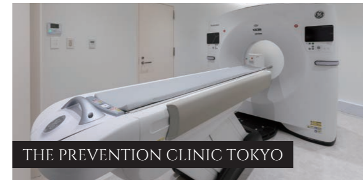
THE PREVENTION CLINIC TOKYO